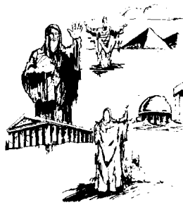
A UNIQUE VIEW OF HISTORY

Many historical statements in The URANTIA Book are not capable of proof or disproof, but the correctness of what I can verify gives me confidence in what I cannot verify. By analogy, if a man makes 1,000 statements to me of which 450 can be verified, and all of the verifiable statements are found to be true, I develop confidence in my source that his remaining statements, which I lack the means to investigate, are likewise true.