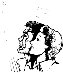
A MAJESTIC VIEW

The spiritual concepts of The URANTIA Book occur in many other places in bits and pieces. What it offers is the manner in which these concepts are filtered out and fitted together into a majestic view of God's relationship with man — who we are, why we are here and how we may continue our journey Godward. In no other writing are such teachings set forth so as to give such a sense of the intellectual, philosophical and spiritual unity of God's dealings with man in the realms of matter, mind and spirit.